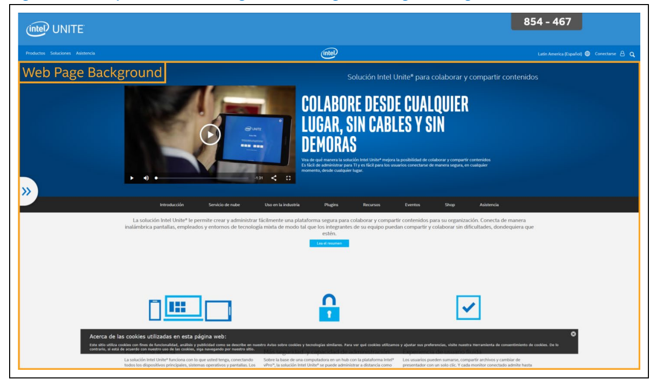
Figure 1. Example of Intel Unite® Plugin for Live Background Using a Web Page URL

You will now see the live background instead of default Intel Unite® app background. Figure 1 shows an example of a hub configured to display web page as the background, and Figure 2 shows an example of a hub configured to display an HTML file; webpages and HTML files both display their content below the header, as delineated by the orange frames.